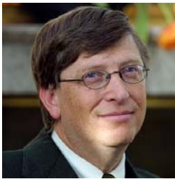
B-J considers another tight over.

B-J probably bowled OK - it looks like it was well tight because he only conceded 6 runs in 4 overs... mean!