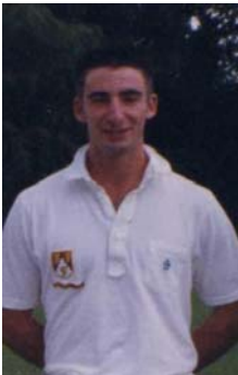
This is a space filler!