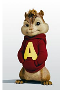
Jay Sz wajbak after taking his fifth wicket

Castor's last 8 wickets fell for 45 runs but Waresley couldn't quite get the 10th wicket leaving only 20 points up for grabs with the batting.